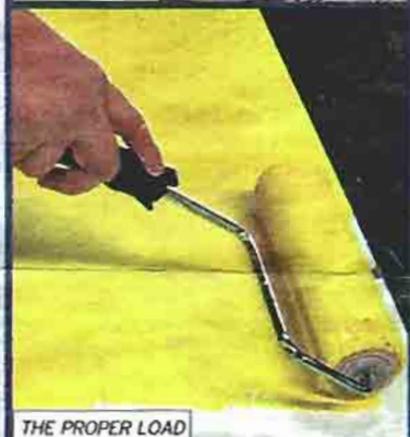
THE PROPER LOAD